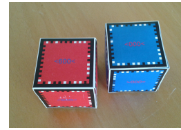
Figure 2. Using AR cube/markers to manipulate in-game elements.

Examination of the range and limits of cognitive reserve capacity (plasticity) by means of cognitive training has been suggested as a promising diagnostic strategy for the early identification of dementia, particularly Alzheimer's disease, in sub-clinical populations [6]. Furthermore, cognitive training aims to help people with early-stage dementia delay the disease's onset and make the most of their memory and cognitive functioning despite the difficulties they are experiencing, by utilising compensatory and/or restorative strategies [1]. Cognitive training shows promise in the treatment of AD, with primarily medium effect sizes for learning, memory, executive functioning, activities of daily living, general cognitive problems, depression, and self-rated general functioning [17], the retrospective and observational designs of the human studies have led to difficulty interpreting the direction of causation between cognitive function and cognitively stimulating activities [13]. To face the new challenges that arise from an ageing society, serious games are presented as a cognitive training platform to slow the cognitive decline of impaired patients.